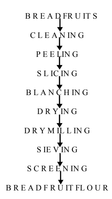
Figure 1. Flow chat for the production of breadfruit flour

age substitution with plantain flour. Notwithstanding a successful substitution of up to 15% of composite flour in the production of baked products will go a long way in reducing cost and enhance utilization. In their own findings Giami et al. (2004), were able to successfully make acceptable bread from composite flour of kernels of roasted and boiled African breadfruit.