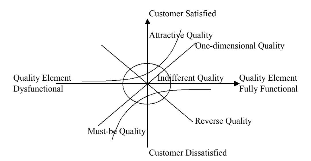
Figure 1. Kano's two-dimensional model.