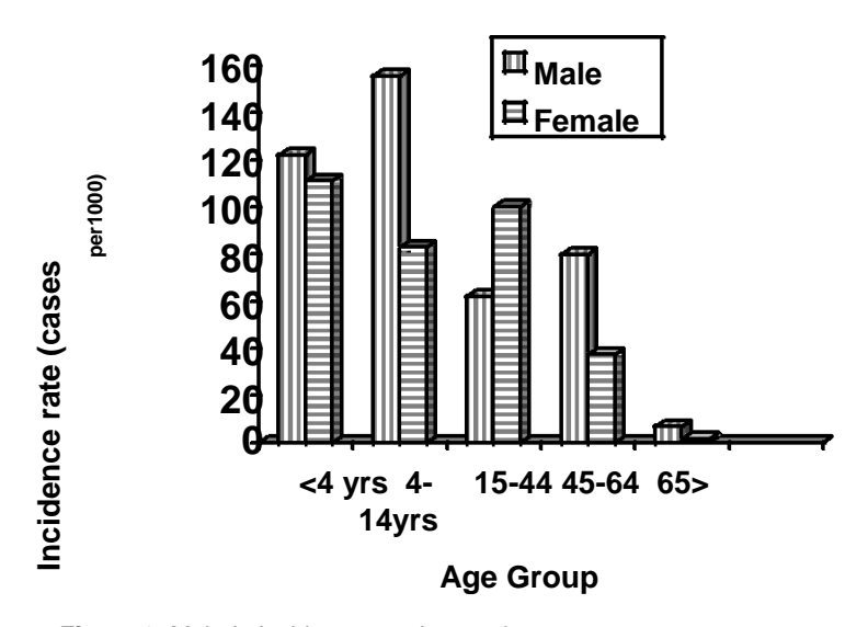
Figure 3. Malaria incidence rate by gender.

characteristerized by substantial inter-monthly variation. Incidence rates show a rising, albeit fluctuating trend with reported cases remaining relatively high (Figure 2).