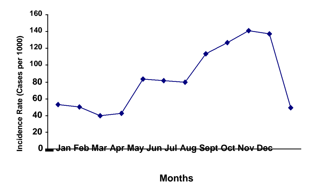
Figure 2. Monthly malaria incidence rate.