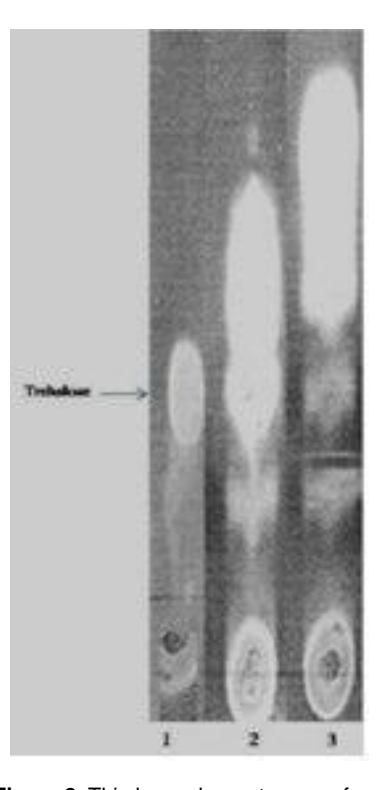
Figure 2. Thin layer chromatogram of standard –trehalose (lane1) spotted alongside homogenate of hypobiotic (lane 2) and mature (lane 3) H. contortus.

Table 4. Relative Trehalose content in arrested and mature H. contortus from goats infected with infective larvae subjected to different combination of temperature and moisture stress