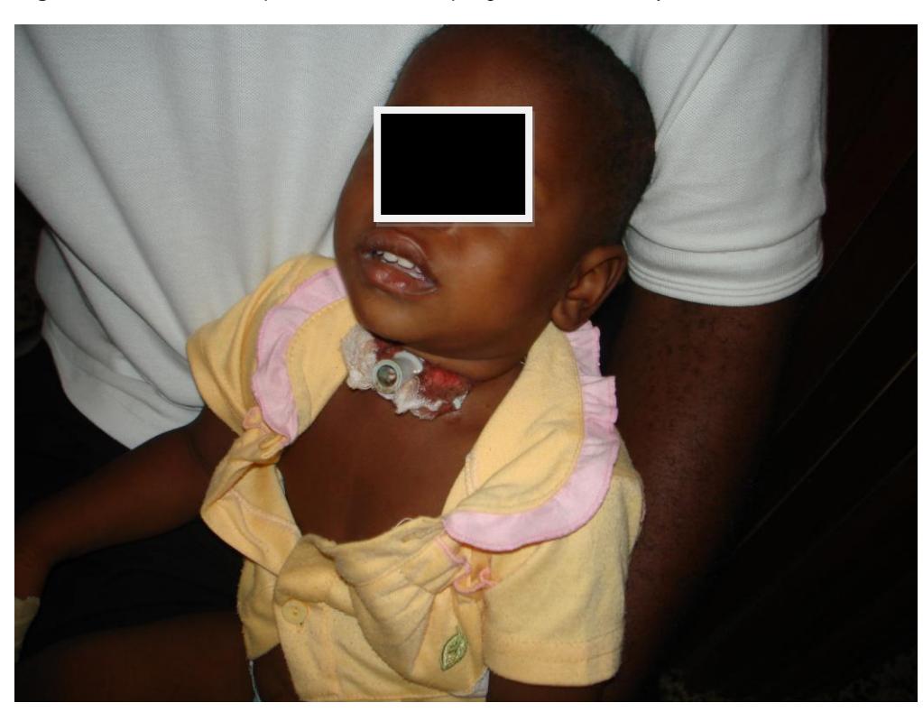
Figure 3: The child who aspirated the metallic spring with tracheostomy tube insitu