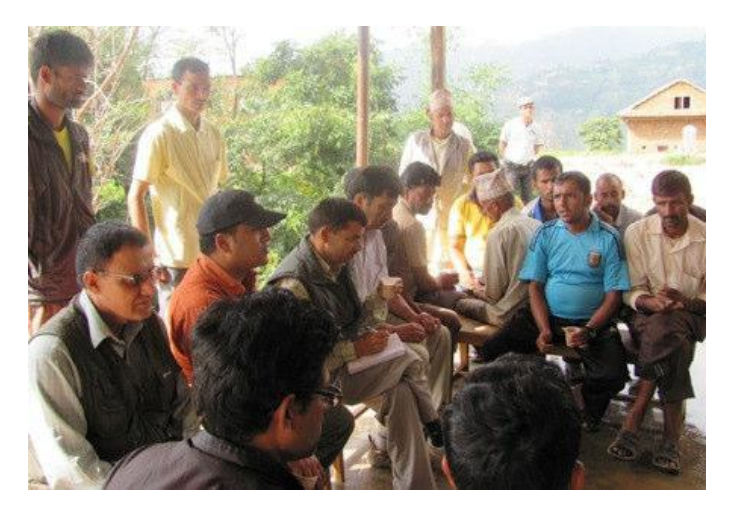
Figure 2b. Meeting with beneficiary farmers of Jumla.