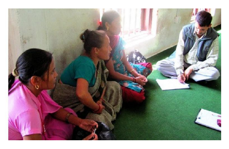
Figure 2d. Discussion with beneficiary women of organic farming.