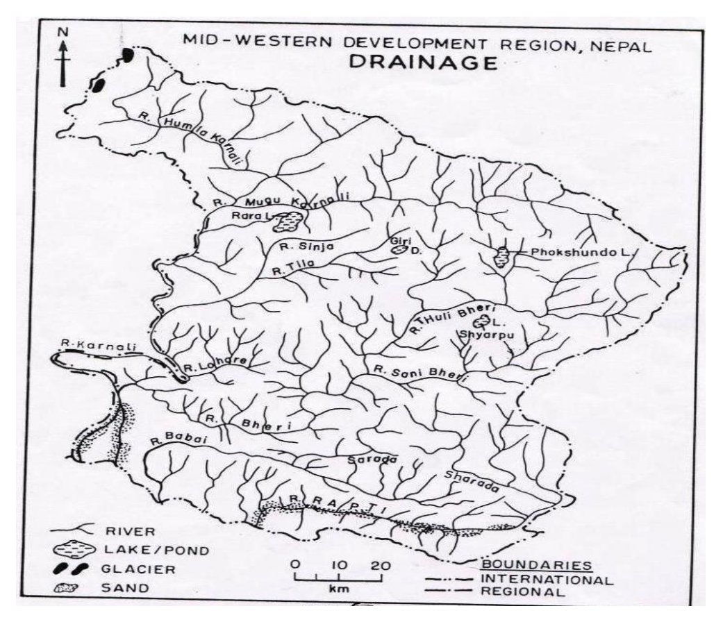
Figure 3. Watershed Management in Karnali watershed Area.

development strategy of Karnali watershed area is selfreliance on resource mobilization by using indigenous knowledge and experiences. Thus, the right mix of traditional knowledge would be a winning combination of resource development. The central thrust of participatory development has to integrate development and conservation, government authorities and local beneficiaries, and coordination of the involved institutions between the decision making and implementation level and that of the micro watershed level. Further, such adaptive model of resource management focuses on environmental feedback to shape policy. Thus, the model explicitly considers social learning and institutional development. Under such provision, large numbers of community based organizations would have evolved out of the region, and would be able to develop locally suitable technology, appropriate policy feedback and strategic clarity for resource development and conservation. Better information system, participatory monitoring and systematic implementation of resource mobilization will also evolve through local initiations. Finally, a specific technique would be modeled against the top-down tendencies for resource based regional development planning in Karnali watershed area and in Nepal in general. For this purpose, it is necessary to