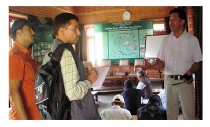
Figure 2a. Briefing of project activities with authors at the field office of the Local NGO.