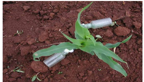
Figure 1. Two viruliferous leaf hoppers are placed in the plastic bottle and a leaf is inserted in the bottle and closed with cotton wool (A) and one leaf was inoculated per plant (B).

and deployment of resistant genotypes is the most appropriate and cost-effective approach to controlling MSVD. However, breeding for resistance requires efficient tools that can reduce the time taken to develop hybrids, and enable breeders to pyramid genes against different strains of the virus. Previously, Kenya Agricultural Research Institute (KARI) obtained resistant sources from International Centre for Wheat and Maize Improvement, Carretera, Mexico (CMMYT), International Co-operation Centre for Agronomic Research for Development, Paris, France (CIRAD), and International Institute of Tropical Agriculture, Ibadan, Nigeria (IITA) which were screened against the MSVD. One of the lines OSU 23i sourced from CIMMYT was found to score better than other lines, and was chosen for the conversion of one locally adapted line EM12-210. The cross between the two was inbred up to S6 generation conventional breeding methods. conventional methods take breeders over 8 years to be able to release a variety with good levels of MSV resistance, there is need to develop, apply and adopt DNA markers in selection as an additional tool. The use of markers has higher chances of success in reducing the duration taken to release hybrids. DNA Markers detects the recovery of the recurrent genome in backcross breeding, and are more efficient in selection of genomes that have recombinant events close to the target gene.