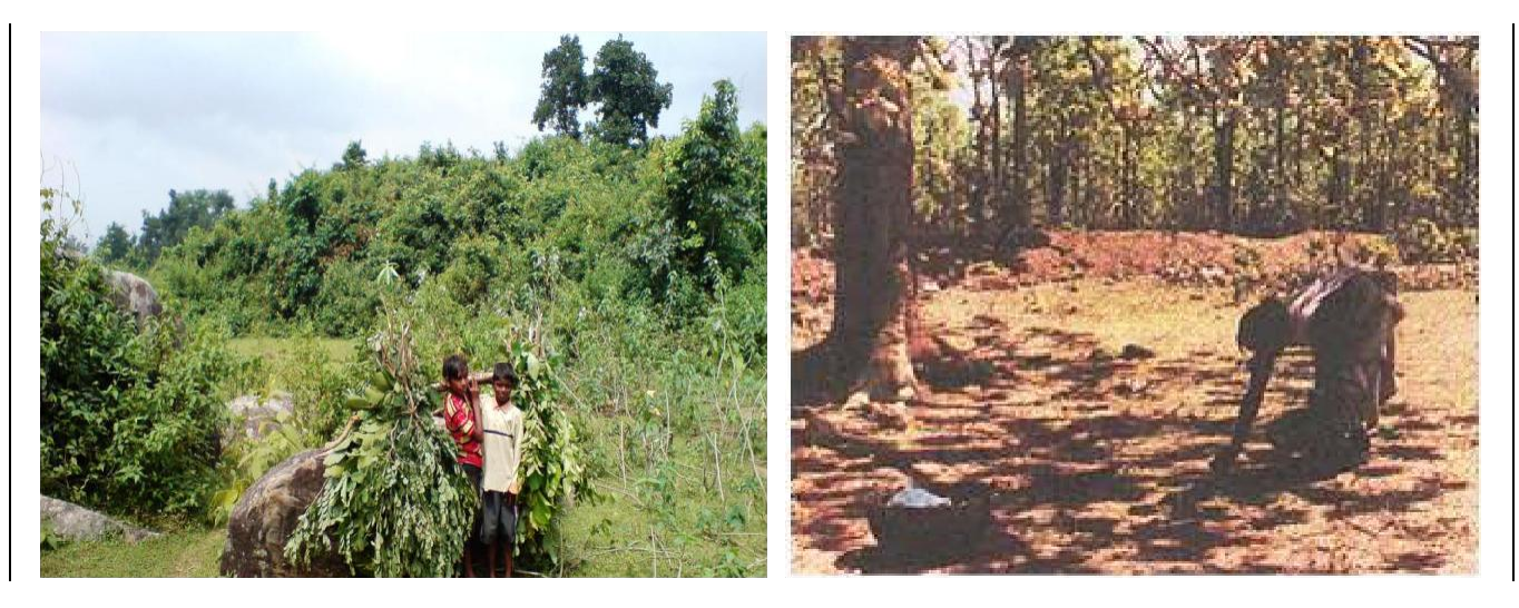
Plate 3. Tribal children and women collect fodder and different types of flowers and leaves from the native forests of Purulia, Bankura and West Midnapur districts.

collection of NTFPs is a secondary job for men, whereas, for women it is their primary source of livelihood. In West Midnapur district, normally Sal leaves and Kendu leaves are collected by women. In Purulia and Bankura districts, Kendu leaves and Kalmegh are mainly gathered by women as well as by children. It is because of the gender division in minor forest products harvesting, the female members have much more knowledge about the social uses of NTFPS than the men. During fieldwork for this research it was noticed that female family members could