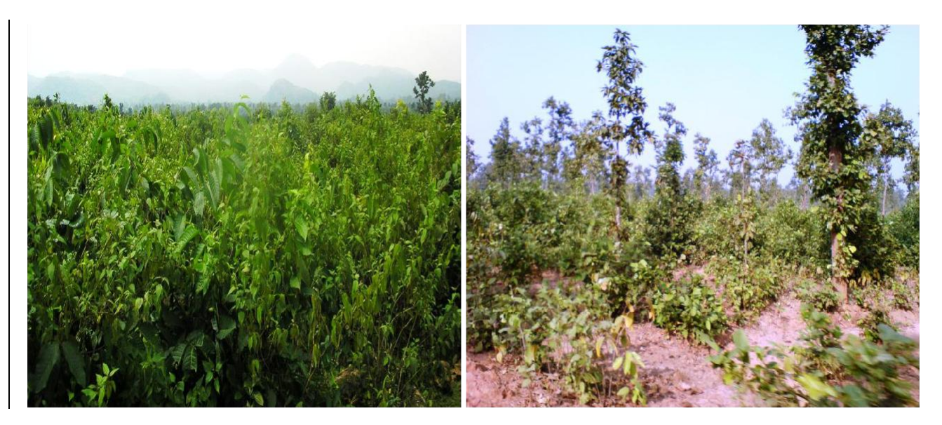
Plate 1. The miscellaneous forests of Purulia (right) and Sal dominated scattered forest of West Midnapur districts.

protected forests of the districts of Purulia, Bankura and West Midnapur are under constant pressure. "...in reserved forest most of the activities are prohibited while in protected forests some activities are permitted unless it is said that you cannot do it. Therefore, in protected forest people are collecting forest products without any difficulty.... That"s why these are more fragile" (Additional Principal Chief Conservator of Forest (APCCF), Govt of West Bengal, interview – 23rd October, 2008).