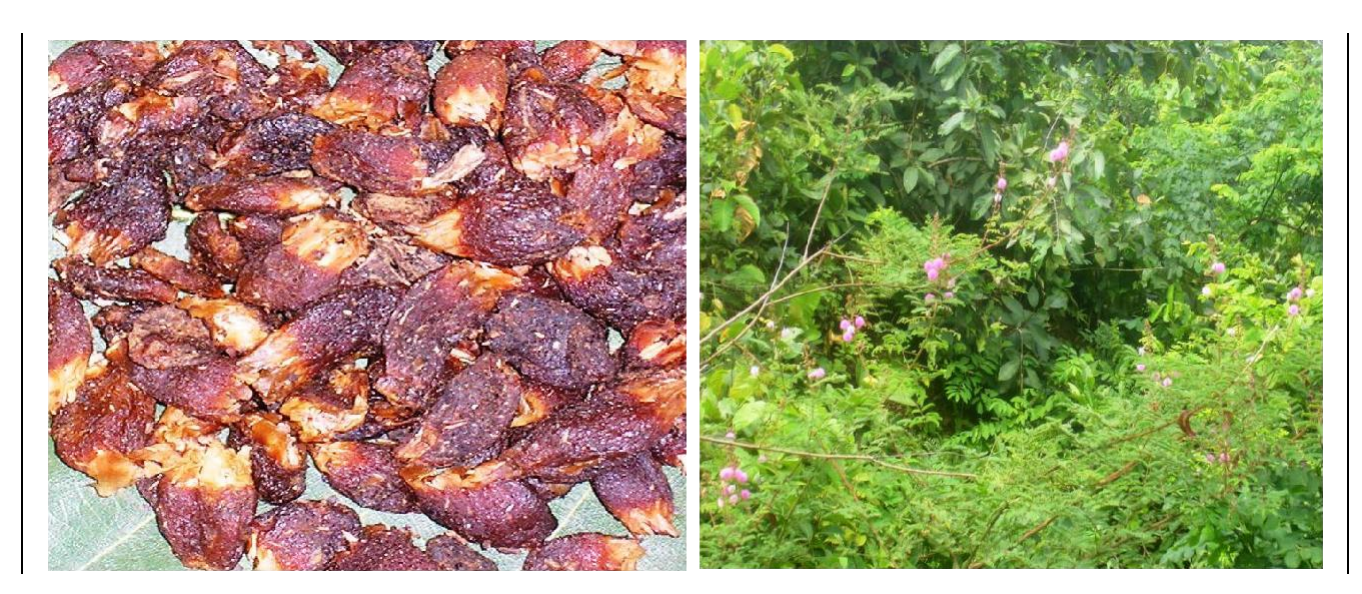
Plate 2. For producing liquor Mahua (Madhuca indica) flowers are very popular in tribal communities of Purulia, Bankura and West Midnapur districts, whereas Tilai (right) flowers are used for worship by tribal forest dwellers of Purulia district.