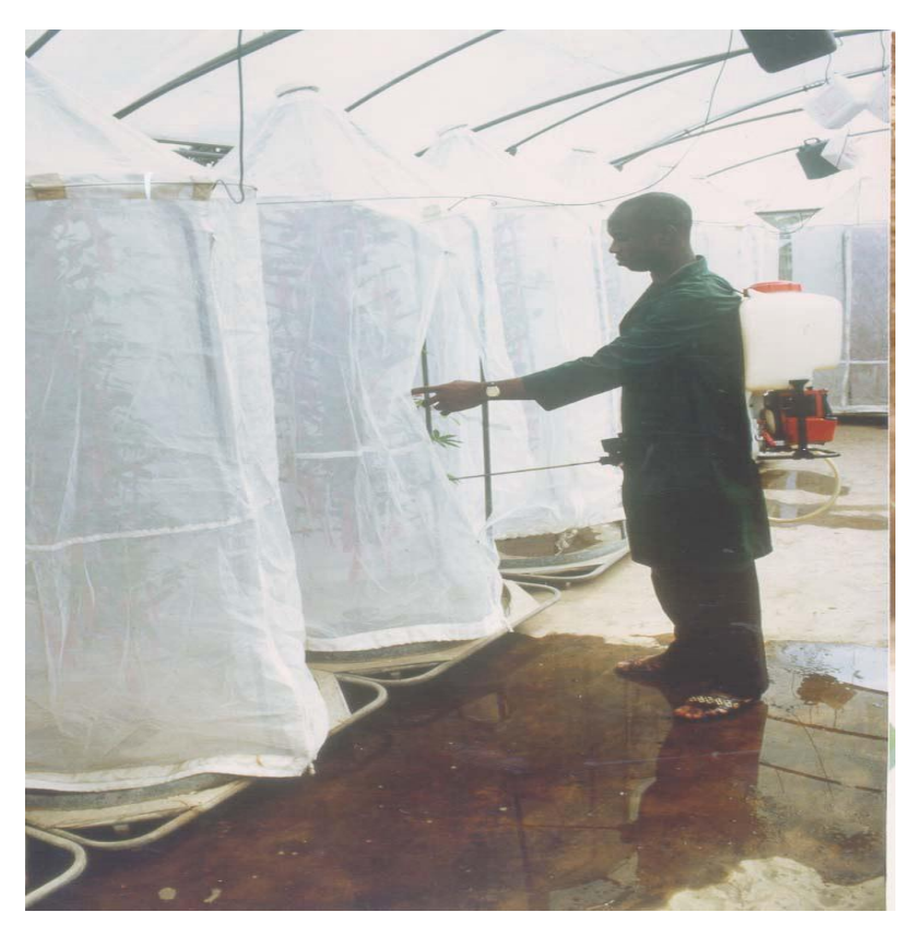
Plate 2. Spraying cassava germplasm after fourth weeks of growth on the abxial surface of the leaves in the screen house with bacterial suspension using motorized sprayer (Made in Germany, Kleinmotore GMBH, Model: Solo TYP 422).

The cassava germplasms were sprayed, inoculated with the suspension of bacterial isolates after fourth weeks of growth on the abaxial surface of the leaves with motorized sprayer (Model: Solo TYP 422) shown in Plate 2. This was carried out very early in the morning before sunrise to facilitate condition for infection. The cassava plants were covered on the plating tray with the net designed to cover the tray as shown in Plate 1 for 24 h before and 48 h after inoculation to enhance maximum humidity. Also the floor of the screen house was kept wet with running water to increase the humidity and to reduce the greenhouse temperature. The symptoms manifestations were monitored and scored periodically for two months based on the responses of the cassava clones to the disease symptom development; a score on disease rating scale of 1 to 5 (where 1 is no symptom development and 5 is severe damage by the disease). The cassava accession were grouped as: (i) Resistant cultivars if they scored less than 2 on the scale; (ii) Mild resistant clones if score was between 2 and 2.5 on the disease scoring scale; (iii) Tolerant cultivars when score ranged from > 2.5 and 3.5 while (iv) Susceptible clones scored > 3.5 and 4. (v) Any cultivar that scored value that is greater than 4 was regarded as highly susceptible.