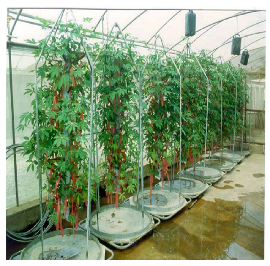
Plate 1. Screen house experimental layout showing cassava accessions planted in a plating tray. Each plating tray holds 68 cassava cultivars. The experimental design is augmented with randomised complete block design (ARCBD).

were grown together and were different from those in the Northern Sudan Savannah, where land races varieties dominated (Ogunjobi et al., 2001; Dixon et al., 2002).