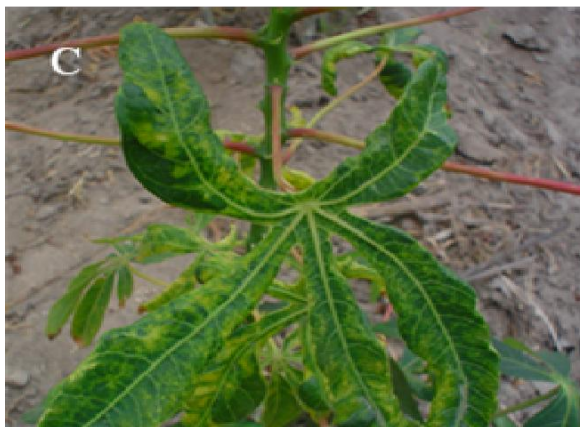
Figure 1. Infection with SACMV (A) Stunting and leaf distortion of tobacco leaves in infected plants (right) and normal looking healthy control (left). Plants were photographed at 28 days post-inoculation (dpi). (B) CMD symptoms on young systemically infected leaves of cassava (right) and young healthy leaves (left). Plants were photographed at 30 dpi. (C) Leaf showing CMD mosaic symptoms in a cassava field in Mpumalanga Province, South Africa.

resistance to SACMV. We believe that biolistic inoculation of SACMV dimer infectious to cassava will expedite screening for SACMV resistance without having to rely on whitefly inoculation, since SAMCV is not mechanically transmissible.