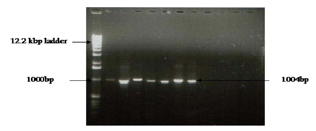
Figure 1. PCR products of amplified DNA from sheep Campylobacter isolates aligning at the 1004bp of a 12.2kbp ladder Lane 1= 1.9kb ladder; lane 2,3,4,5,6,7, 8 amplified bands of DNA from sheep Campylobacter strains.