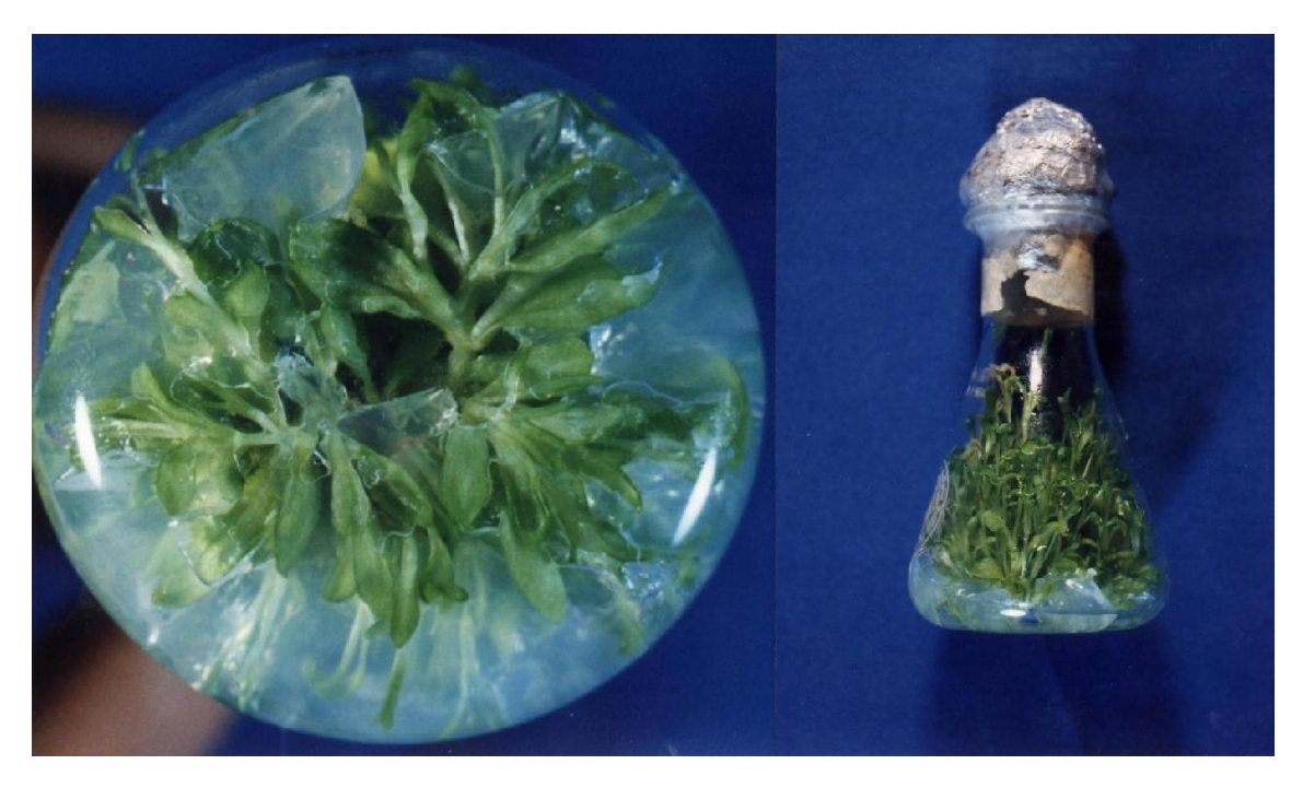
Figure 1. High shoot proliferation in 'Rotem' at second subculture. Left: bottom of flask view, Right: front view.

Means followed by the same letters (small letters for means and capital letters for total means) are not significantly different according to DMRT at 1% level.