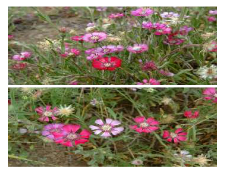
Figure 1. Two views of C. tchihatcheffii and flower structures in situ.