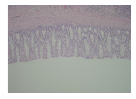
1 (A) Normal control group. Photomicrograph of the haematoxylin & eosin stained section of rat colon showed intact epithelial surface x 100.