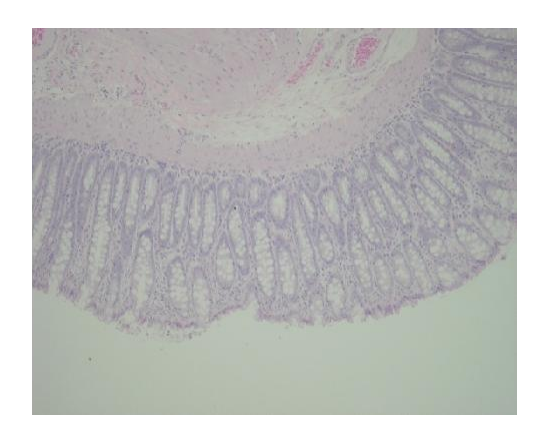
Figure 1 (D)Captopril treated g moderate protection compared to 100

current study as evidenced by a significant increase in colonic MDA as well a significant decrease in colonic GSH.