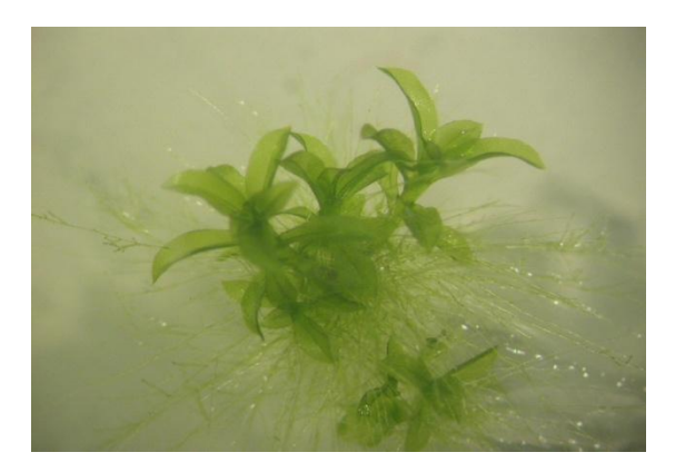
Figure 1. Axenical culture of A. undulatum.