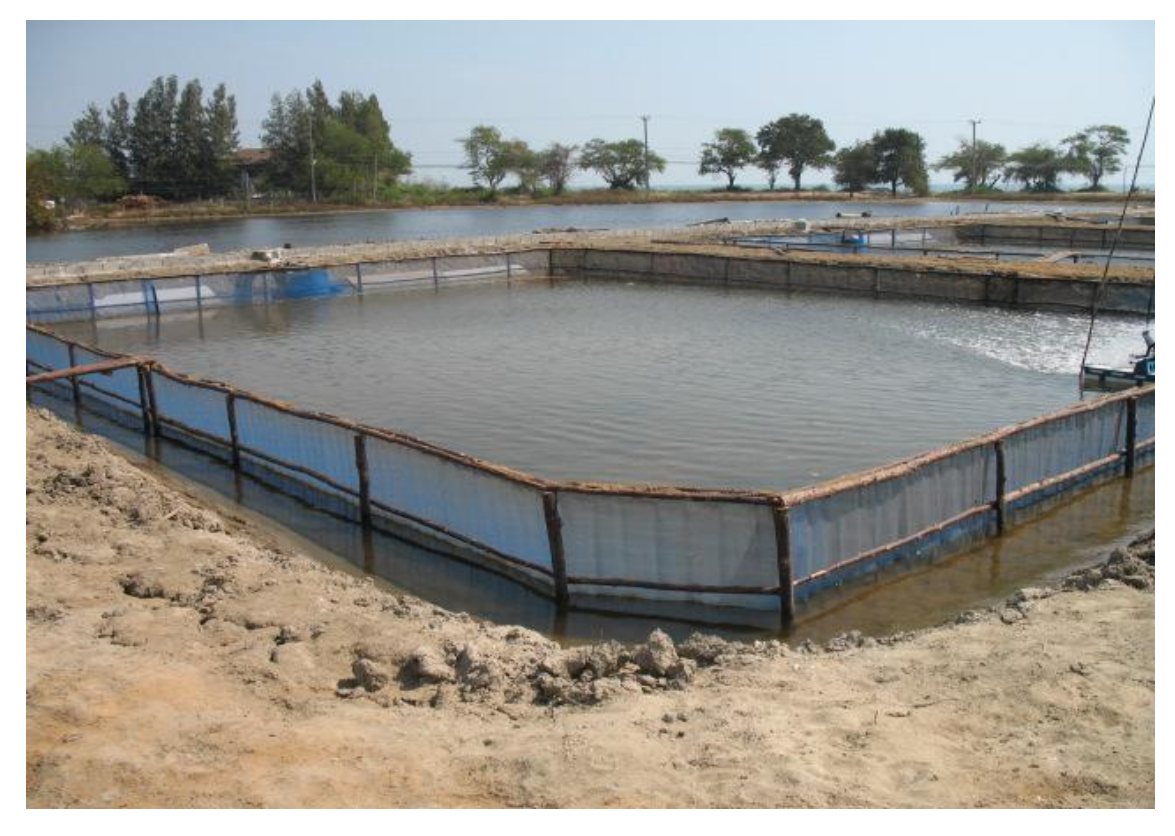
Figure 2. Grow out of B. areolata to marketable sizes using large-scale earthen ponds of 20.0x19.0x1.2 m.