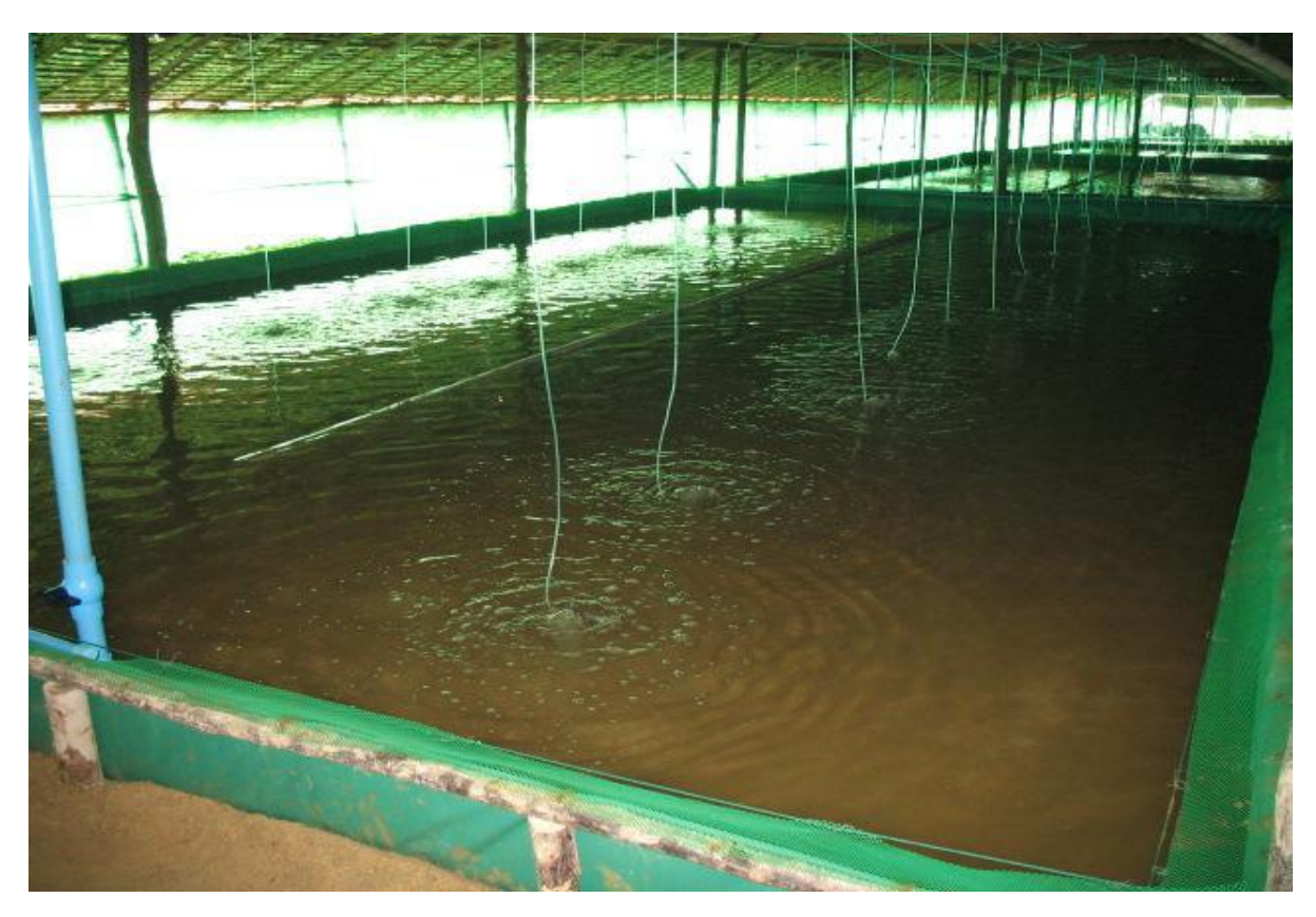
Figure 1. Grow out of B. areolata to marketable sizes using large-scale flow-through canvas ponds of 6.0x12.0x0.4 m.