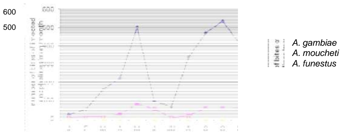
Figure 3. Monthly variation of malaria transmission of the 3 vectors at Ekombitié in 2007.