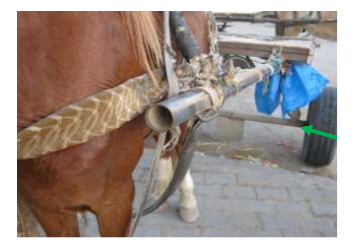
Figure 1. Shaft of charette.