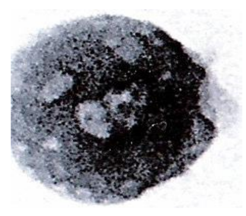
Figure 3. TEM of Cytarabine containing nanoparticles. Figure 3 showed the surface morphology of nanoparticles.

The values of Cy-A, Cy-B, Cy-C, Cy-D are the % drug released at different time intervals. Table 2 showed that Cy-A showed controlled drug release from the third