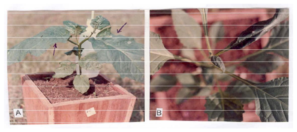
Figure 2. Responses to colchicine treatment in species of Solanum L. ( A ) Gigas nature of first formed leaves following colchicines treatment in S. aethiopicum and ( B ) suppression of shoot growth in S. indicum following treatment with colchicine.

fixed in Carnoy's fluid for a minimum of 3 h. Anthers were dissected out from these buds and fixed in FLP- orcein. The stages of meiosis were monitored and the associations during diakinesis stage were assessed in both the diploid and colchiploid material, to ascertain chromosomal affinity. Staining pollen grains from immature flower buds with a drop of cotton blue in lactophenol was used to assess pollen grain characteristics. After staining these were left to stand for at least 48 h to ensure proper turgidity of the pollen grains for easier assessment. Deeply stained grains were adjudged fertile while poorly stained, unstained and malformed pollen grains were taken to be sterile.