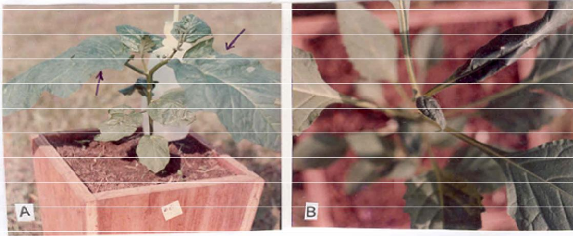
Figure 2. Responses to colchicine treatment in species of Solanum L. (A) Gigas nature of first formed leaves following colchicine treatment in S. aethiopicum and (B) suppression of shoot growth in S. indicum following treatment with colchicine.

fixed in Carnoy's fluid for a minimum of 3 h. Anthers were dissected out from these buds and fixed in FLP-orcein. The stages of meiosis were monitored and the associations during diakinesis stage were assessed in both the diploid and colchiploid material, to ascertain chromosomal affinity. Staining pollen grains from immature flower buds with a drop of cotton blue in lactophenol was used to assess pollen grain characteristics. After staining these were left to stand for at least 48 h to ensure proper turgidity of the pollen grains for easier assessment. Deeply stained grains were adjudged fertile while poorly stained, unstained and malformed pollen grains were taken to be sterile.