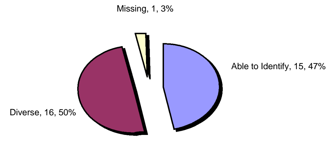
Figure 3. Able or not to identify the organizational culture.

firms (20.83%) followed by "customer's satisfaction", "continuous reservoir of jobs in hand", and "keep operational cost to optimum and manageable".