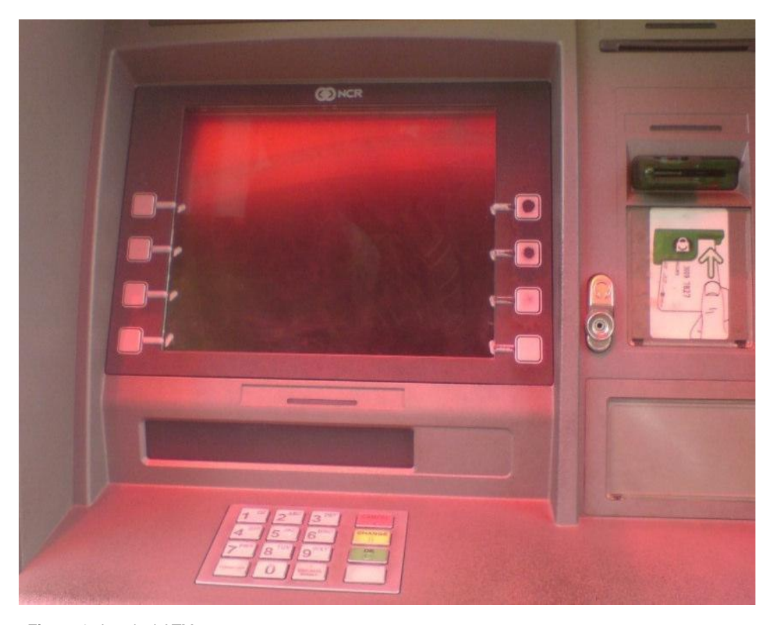
Figure 1. A typical ATM.