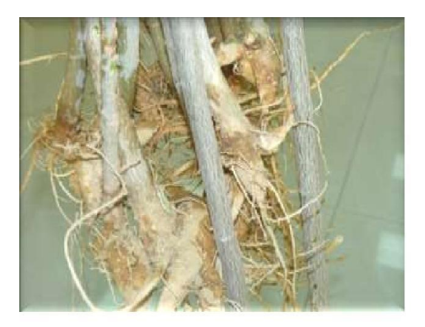
Figure 3. Moringa roots.