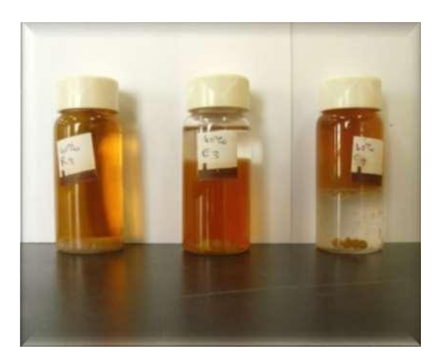
Figure 5. Ethanol, chloroform, and ether extraction of Moringa roots.

observed for the ethanol and chloroform extracts was 70 % for weight, and 74% for surface area, respectively. The