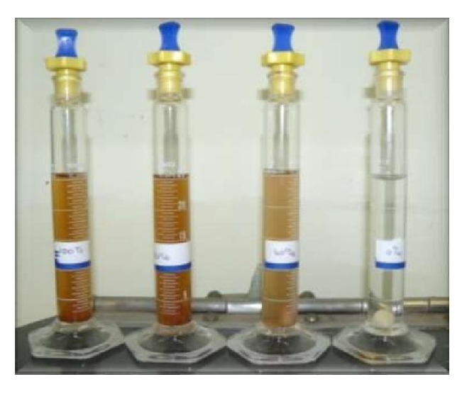
Figure 6. Dissolution of canine uroliths in aqueous solution.