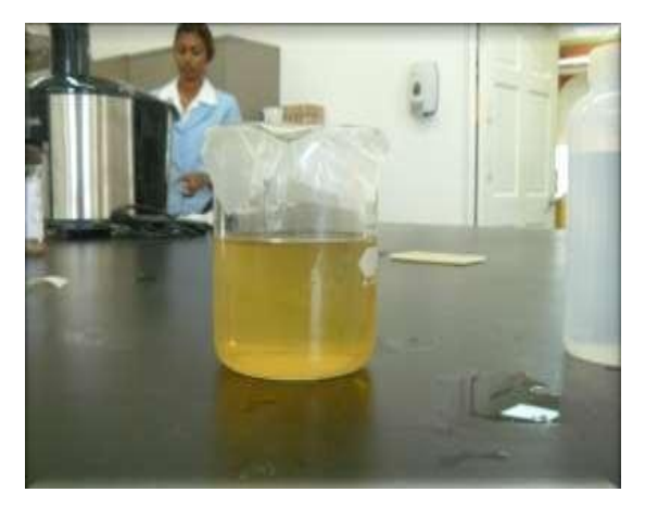
Figure 4. Aqueous extraction of Moringa root.