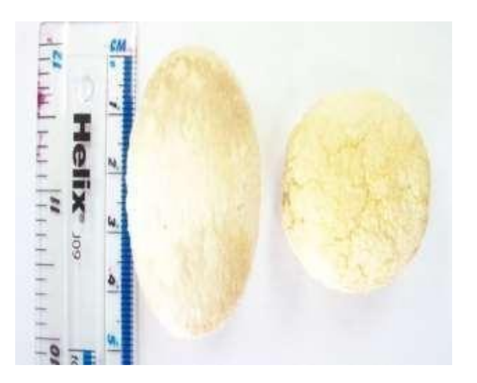
Figure 1. Size of canine calcium uroliths.