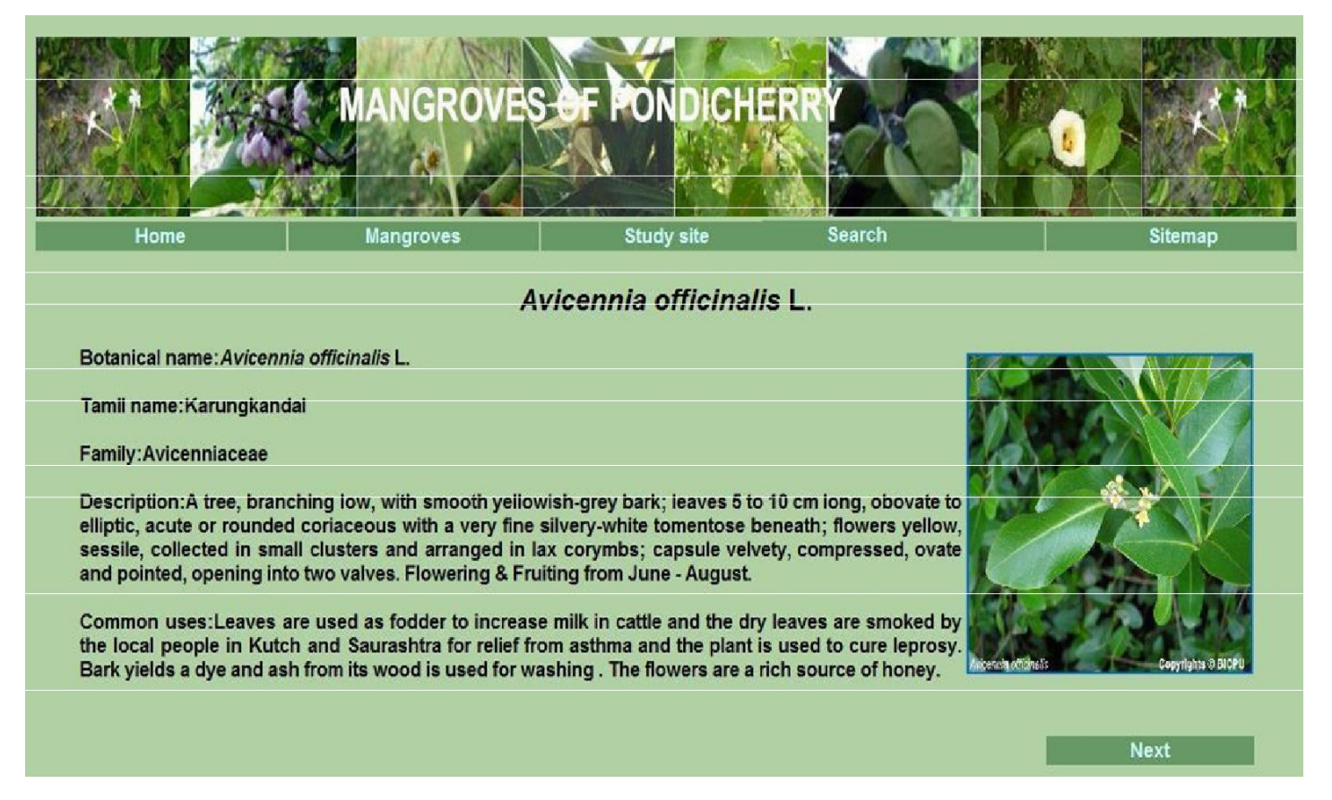
Figure 4. A screenshot of a mangrove entry (e.g. Avicennia officinalis L.) of Pondicherry region.

Avicennia (Avicennia marina and Avicennia officinalis), Rhizophora (Rhizophora apiculata and Rhizophora mucronata), Sesuvium portulacastrum, Suaeda (Suaeda maritima and Suaeda monoica), Clerodendrum inerme, Ipomoea pescapre and Pandanus tectorius. However, Exocoecaria agallocha was seen sporadically growing along the riversides, instead of forming the community or clump. The mangrove diversity observed is presented in Tables 1 and 2.