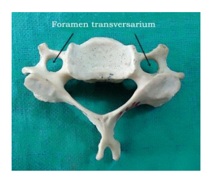
Figure 1. Foramen transversarium in typical cervical vertebrae.