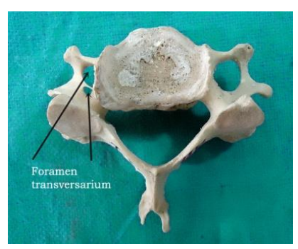
Figure 2. Left unilateral duplication of foramen transversarium in typical cervical vertebrae.