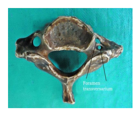
Figure 4 . Right unilateral duplication of foramen transversarium in atypical cervical vertebrae (C7).