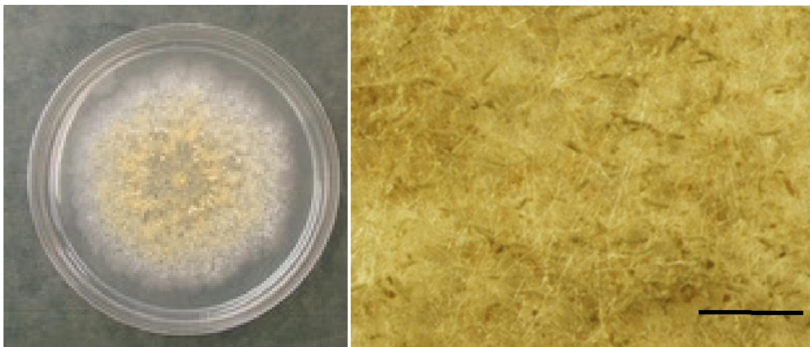
Figure 2. Colony A. flavus NRRL 3357 (A) and its typical conidia (B) The fungus was grown on Czapek medium without Avid ® incubated at 30°C in the dark for 7 days. (bar = 1 mm.)

has previously been reported. \text{NaNO}_3 was shown to be an excellent nitrogen source for synnema/sclerotium formation while ammonium sulfate inhibited growth, sporulation and synnema/sclerotium formation of A. caelatus and a mutant strain of A. flavus (McAlpin, 2001; 2004).