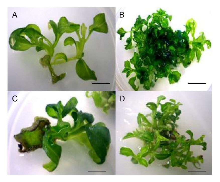
Figure 2. Shoot regeneration of Orthosiphon stamineus from different type of explants. A, Petiole explants cultured at 1.0 mg/L BAP and 0.2 mg/L NAA after 4 wks culture. B, Petiole explants cultured on 1.0 mg/L BAP and 0.2 mg/L NAA after 8 wks culture. C, Leaf explants cultured on 2.0 mg/L BAP and 0.2 mg/L NAA after 8 weeks. D, Stem explants cultured on 0.5 mg/L BAP and 0.2 mg/L NAA after 8 wk. Scale bars represent 1 cm.

<sup>1</sup>Mean ± Standard Error Mean. The different letters in a column were significantly different by the ANOVA at P<0.05 level.