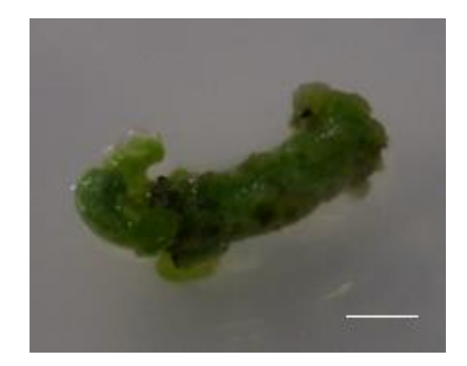
Figure 1. Callus formation from petiole explant after 2 weeks culture. Scale bar represents 1 cm.

concentrations of BAP and NAA on different types of explants and its regeneration were discussed in detail.