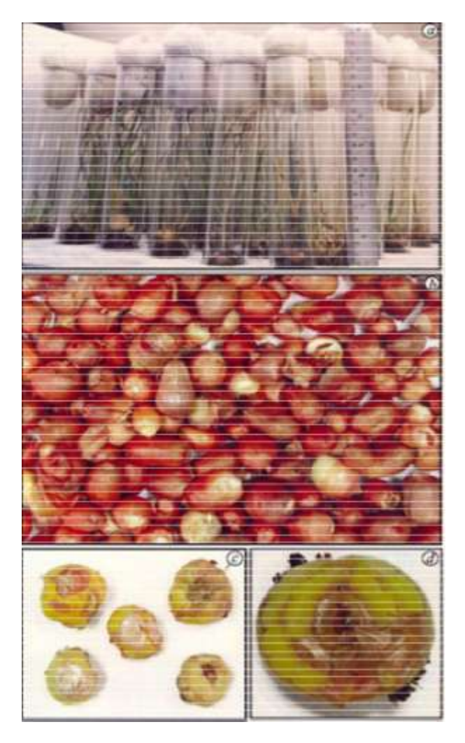
Figure 2. a-b-Mass propagation of in vitro micro corms; c-d-corms in field condition after first (c) and second (d) season

biodegradable matrices like coir and Luffa -sponge in plant tissue culture practices as reported by the present group in a number of plant systems (Gangopadhyay et al., 2002; 2004a). The promoting effect of high concentration of sucrose in microcorm formation, however, has been reported earlier (Steinitz, et al., 1991) and it showed its significant effect irrespective of matrices, agar or coir