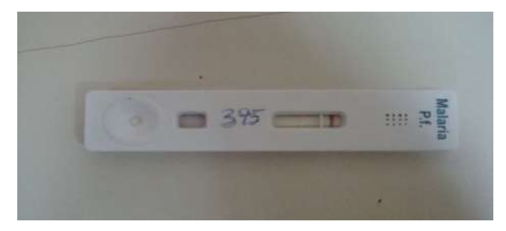
Figure 2. A negative test: note the presence of a single vertical (pink) band in the control window only. Unlike figure 1, a second vertical (pink) band is absent in the test window.