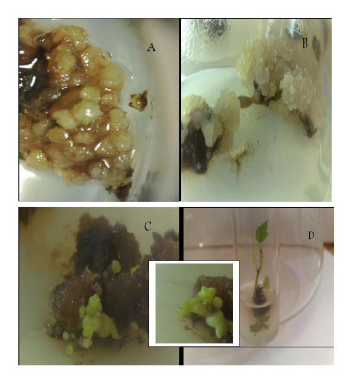
Figure 1. Somatic embryogenesis and plant regeneration of Gossypium spp. (A), Pre-embryogenic cultures; (B), non-embryogenic cultures; (C), somatic embryos at various developmental stages; (D) germination of somatic embryos.