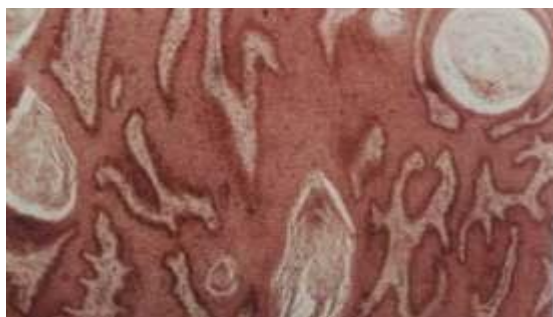
Figure 5. P. osun in 1% ammonium hydroxide in 70% ethanol (skin) X100.