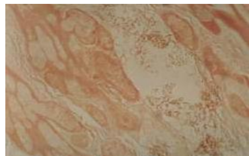
Figure 3. P. osun in 1% acetic acid in 70% ethanol (skin), X100.