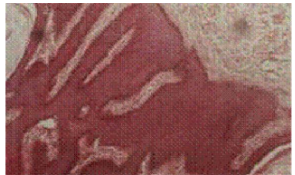
Figure 1 (Control). Haematoxylin and eosin technique (skin), X100.

1% (w/v) alcoholic P. osun in solutions of 1 % acetic acid (Figure 3) and of ammonium hydroxide (Figure 5) (acidic and alkaline solutions respectively) stained tissue sections reddish brown. The addition of potassium alum as a mordant did not improve the staining qualities of P. osun as shown in Figure 4.