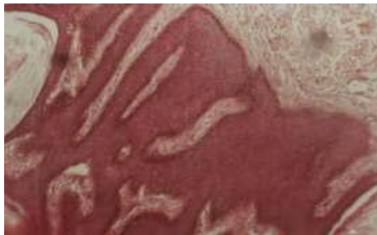
Figure 4. P. osun in 70% ethanol saturated with potassium aluminium alum (skin), X100