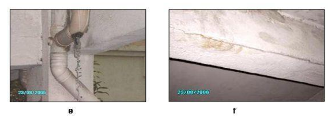
Figure 3. Façade and services defects at post occupational stage.

a tribulation free house, it requires some consultation and rethinking of the housing design programme. The maintenance experts along with user's interaction and interventions are important to incorporate at design stage, in order to consider it responsible design practices for user based tribulation free homes. The following criteria can be taken into consideration to effectively address the existing design problems and also to identify