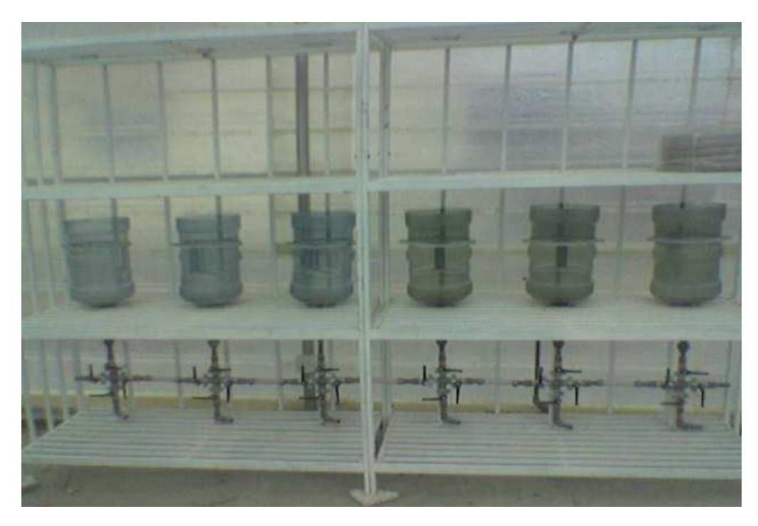
Figure 1. Pilot plant set-up.