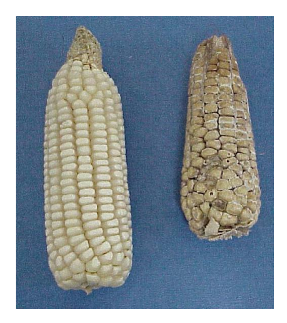
Figure 1. Apparently healthy maize cob (left) and Fusarium -infected maize cob (right).