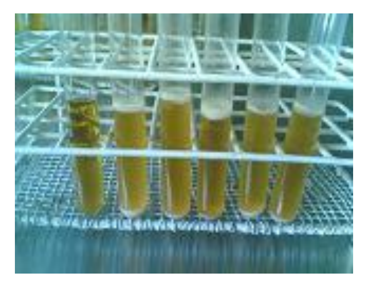
Figure 4. Growth of L. bulgaricus in MRS broth.

B. subtilis , ATCC #6633, E. coli , ATCC, #10536, S. typhi , ATCC# 19430, S. aureus , ATCC #6538, V. cholerae ,