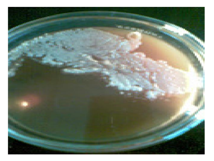
Figure 2. Growth of L. bulgaricus on MRS plates.

Salmonella typhi, ATCC# 19430, Staphylococcus aureus, ATCC #6538, Vibrio cholerae, ATCC # 25870 were determined by the agar diffusion method according to Tag and Mc Given. The test organisms were obtained from Microbiology Section of Drugs Control and Traditional Medicines Division, National Institute of Health, Islamabad, Pakistan. Fresh indicator organisms of ATCC cultures were prepared by spreading each target organism on nutrient agar plates. Bacteriocins extracted were inoculated in the wells in pre-seeded agar plates. Reference standard of Ofloxacine (100 \mu g/ml) was inoculated in the same Petri plates as a positive control. The plates were kept undisturbed for 2 to 3 h and then incubated for 24 h at 37°C aerobically. Finally, the plates were examined for the presence of inhibition of zones by the help of verniercalliper in mm (Reinheimer et al., 1990).