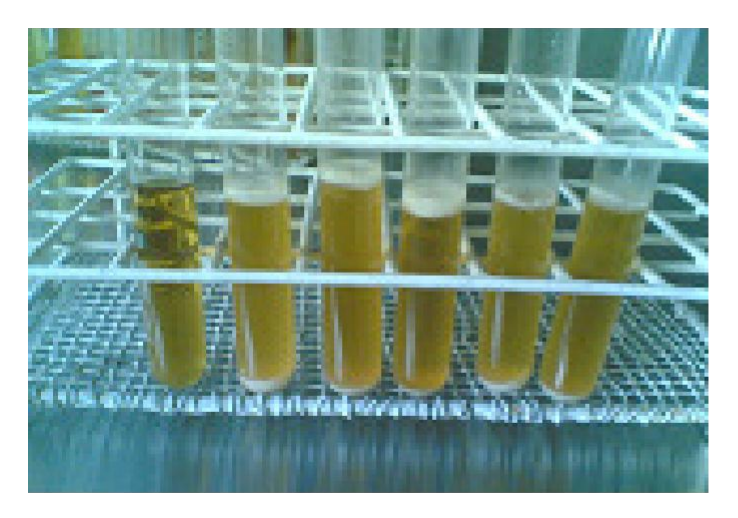
Figure 1. Growth of L. bulgaricus in MRS broth.