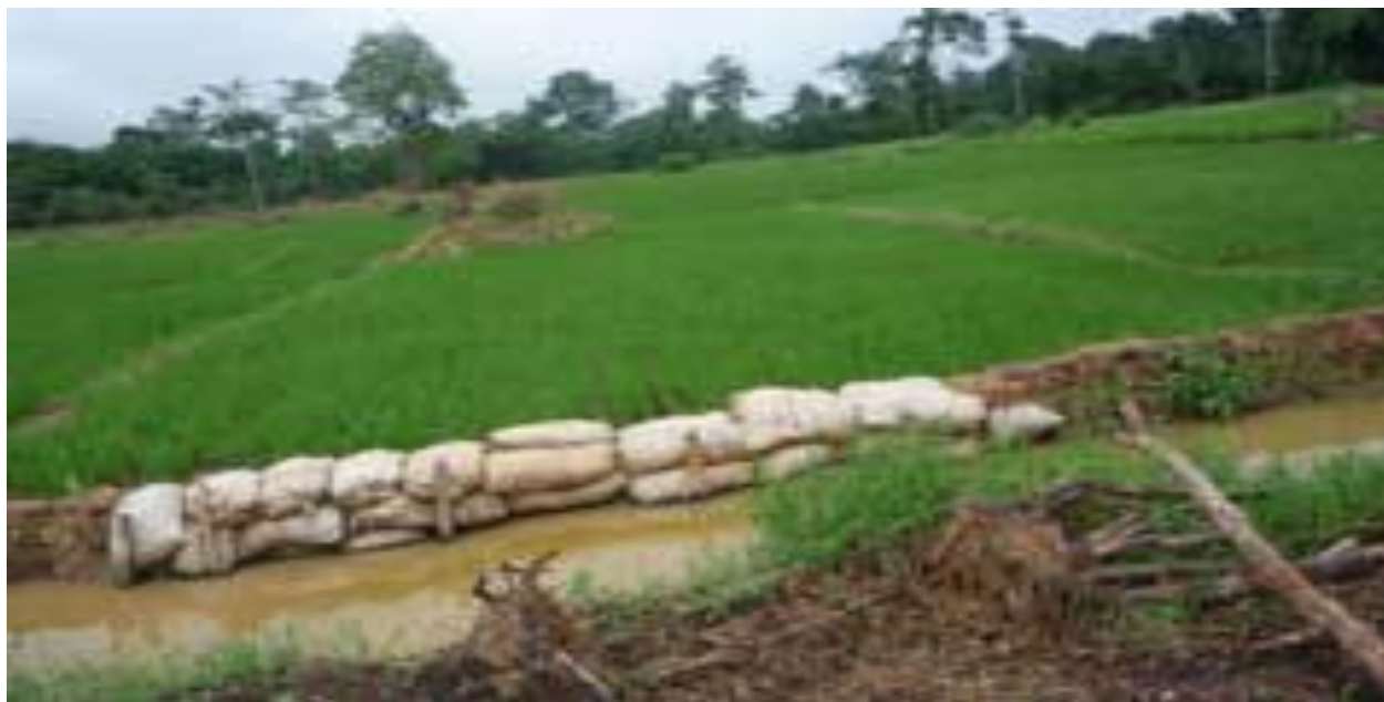
Figure 2. Sawah rice production system in the inland valleys in Nigeria and Ghana.

land. Customary land tenure systems, under which often farmers do not hold title to the land they cultivate, have been charged with failing to provide farmers with adequate incentives to adopt new technologies that could enhance production.