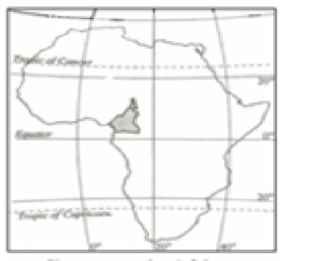
Cameroon in Africa