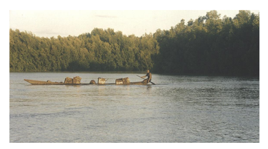
Figure 2. Overloaded canoes with mangroves wood in the Wouri River (Douala).