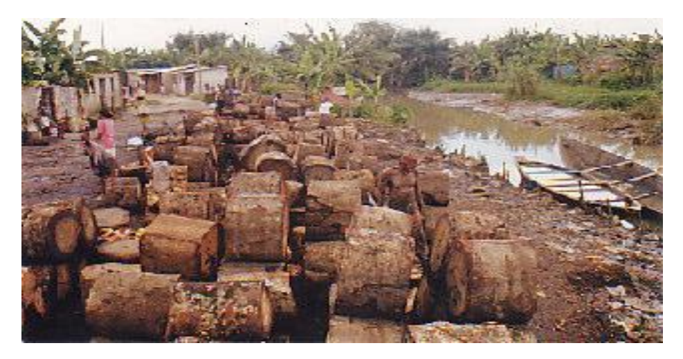
Figure 3. A mangrove wood market behind the Douala international airport.

and leaves are seldom of interest to the loggers (less than 2 percent). Consequently, they constitute an important loss during the mangroves exploitation. The real production of mangroves is greater than half million cubic meters per annum, but it is mostly discarded as litter.