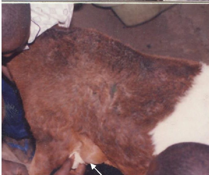
Figure 1. The abscess – Arrow pointing to the circumscribed swelling.