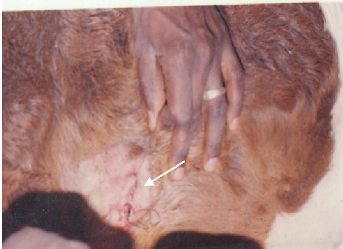
Figure 4. Stitched wound – Arrow points to the stitched area with the most ventral aspect of the wound left unstitched for continuous drainage.