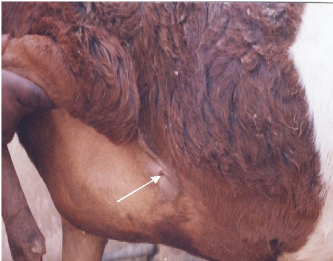
Figure 5. Healed wound – Arrow points to the scar formed after the wound has healed completely.

the seed kernel was purchased from a local processor/vendor in Gombe State, North Eastern Nigeria. A simple interrupted suture was applied to the wound using a silk non-absorbable suture (Figure 4). The most ventral aspect of the wound was left unsutured to allow for continuous drainage. Crude neem oil was then applied topically to the sutured wound. No repeat application of the neem oil was made and no antibiotic (topical or systemic) was given to the ram or applied to the wound. The animal was then monitored daily for a period of 5 days for re-infection and wound dehiscence. None was observed. Neem oil was found to be highly