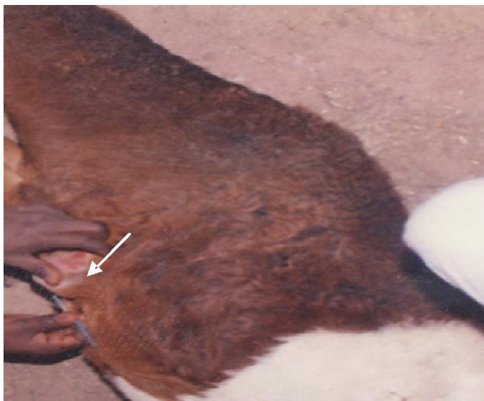
Figure 2. Abscess being infiltrated with Xylocaine before lancing.

offers answers to the major concerns being faced by mankind (Cornborough, 2002). Neem and its products have anti-fungal, anti-bacterial, anti-inflammatory, antiviral, anticancer, antidiabetic and immunomodulatory activities also have been reported to have wound healing properties (Biswas et al., 2002). This case is aimed at reporting the wound healing property/activity of crude neem oil ( A. indica ) in a field situation as there are limited reports on its use in the treatment of septic wounds.