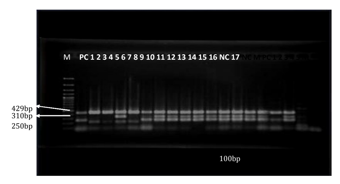
Figure 1. Multiplex PCR with three pairs of primers for detected S. enteritidis isolated (poultry source); M: marker 100 bp; PC: positive control; NC: negative control ( E. coli ); lane 17: Product without the DNA template; lane 1, 2, 4, 15: Salmonella spp. and other lane for positive S. enteritidis .