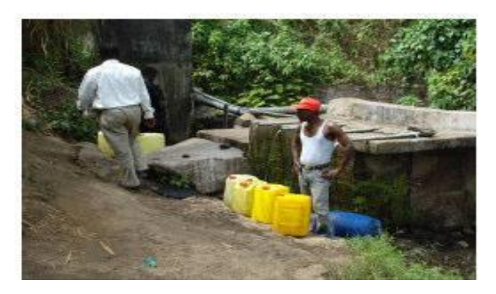
Figure 4. Level of source water protection (Koke water).

the media and land/property owners around the water sources. Notes were taken during the interviews which were also digitally recorded for further consultation.