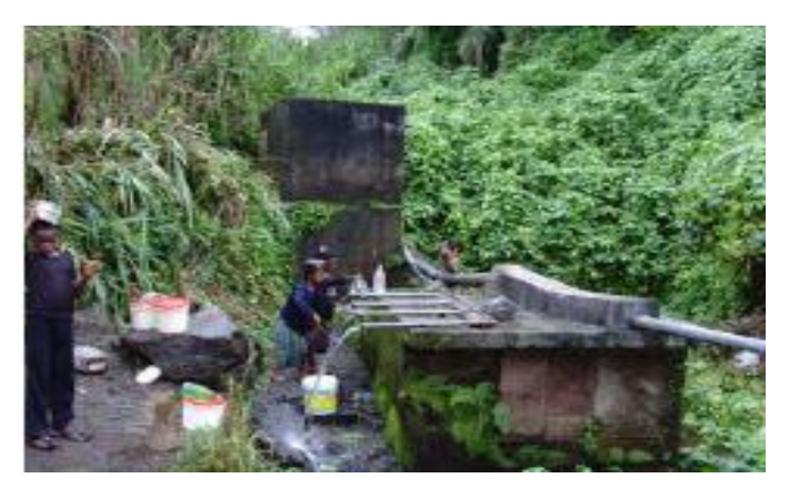
Figure 1. Community water supply scheme (Koke).

(b) Evaluate the capacity for source water protection in Buea municipality.