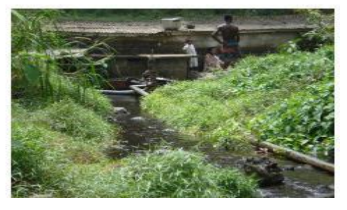
Figure 3. Level of source water protection (Small Soppo).

Table 4. Observed activities in the vicinity of individual water sources.