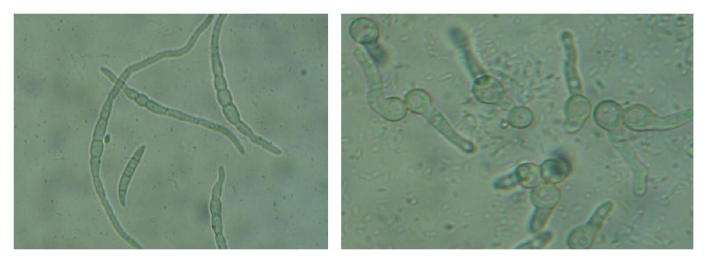
Figure 3. Photograph showing germinating conidia of F. verticilloides (left) and A. flavus (right) in pepper and tomato extracts respectively (X 1500).

Aspergillus, Cladosporium, Fusarium and Penicillium whereas Mucor, Neurospora and Trichoderma occurred occasionally. The fungal species isolated from the fruit surface settled on the surface of the specimens from the field (field fungi) or in the market (storage fungi). Domsch et al. (1981) postulated that the contamination of feedstuffs with fungal species was as a result of natural extraneous contamination by dust during storage in humid conditions. Bankole (1996) reported of Aspergillus, Cladosporium and Fusarium as the most frequent fungal genera on non-surface sterilized tomato seeds. Earlier, Arinze (1986) and Oladiran and Iwu (1993) had reported the occurrence of the three fungal genera on rotten tomato fruits.