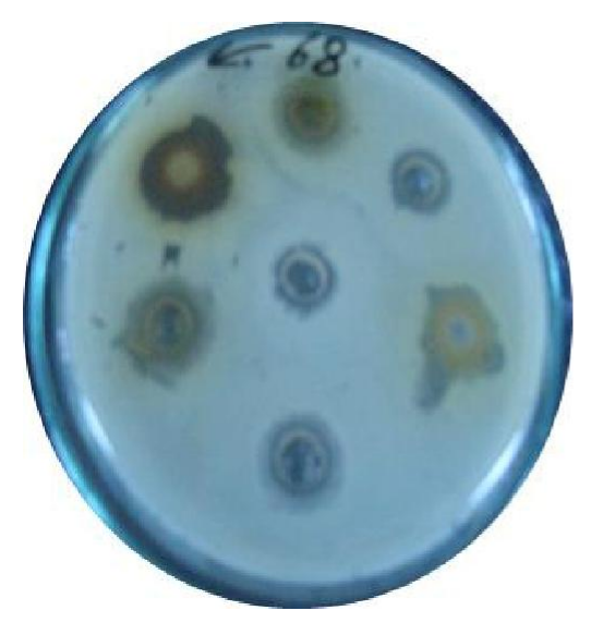
Figure 2. Zone of inhibition of different probiotics showing fungicidal activity of L. acidophilus (mare colostrums, goat colostrums, buffaloe –cow milk), L. palantarum (cow milk), L. rhamnosus (cow milk), Bifidobacterium (cow milk) and B. suibtlus (mare fecal sample) in sequence with the arrow show in C. albicans .

Falagas et al. (2006) proved the efficacy of using L. acidophilus , L. rhamnosus GR-1 and L. fermentum RC-14 in reducing the vaginal candidiasis colonization.