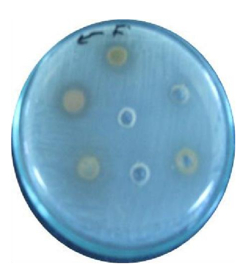
Figure 3. Zone of inhibition of different probiotics showing fungicidal activity of L. acidophilus (mare colostrums, goat colostrums, buffaloe –cow milk), L. palantarum (cow milk), L. rhamnosus (cow milk), Bifidobacterium (cow milk) and B. suibtlus (mare fecal sample) in sequence with the arrow show in A. fumigatus .

Falagas et al. (2006) proved the efficacy of using L. acidophilus , L. rhamnosus GR-1 and L. fermentum RC-14 in reducing the vaginal candidiasis colonization.