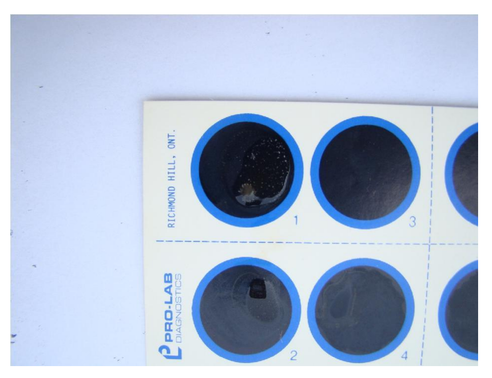
Plate 2. Showing positive (+++) strong clumping of latex beads in cell 1.

Calves = 3-12 Months, Adults =>12 Months.