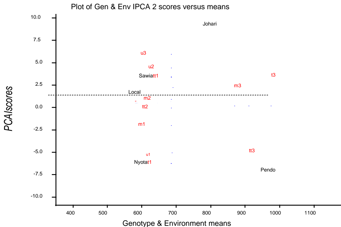
Figure 3. IPCA1 scores of five varieties, twelve environments and genotype x environment means. Key: u1, 2 and 3 = Usanganya for seasons 1, 2 and 3; m1, 2 and 3 = Mkolye for seasons 1, 2 and 3; t1, 2 and 3 = Tumbili for season 1, 2 and 3; tt1, 2 and 3 = Tutuo for seasons 1, 2 and 3. Local = Mamboleo.