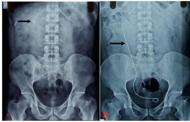
Figure 1. (A) Preoperative X-ray KUB revealed stone shadows (arrow) in the right abdominal area. (B) Postoperative KUB showed no stone shadows and arrow show DJ stent.