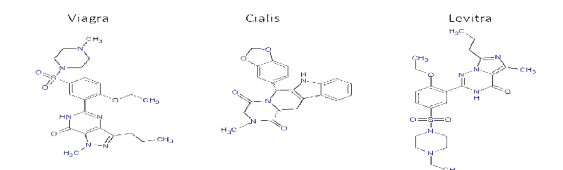
Figure 1. Chemical structure of PDE- 5 inhibitor used for treating ED.

performance. Over 150 million men worldwide are struggling with ED (McKinlay, 2000). The etiologies of erectile dysfunction can be psychological and physical factors, although in most cases both mechanisms interplay. Psychological factors include depression, relationship issues, sexual ignorance, fear of failure, performance anxiety, and childhood or adult sexual abuse. Physical factors may be vasculogenic as in diabetes, hypercholesterolaemia and hypertension. smokina. neurogenic as in spinal injuries, endocrinal as in hypogonadism and hypothyroidism, and local penile tissue factors as in Pevronie's disease. Recent studies have shown the association of erectile dysfunction with metabolic syndrome and cardiovascular disease. Erectile dysfunction is now considered a marker for these conditions and consequently the management of erectile dysfunction now concentrates on screening for, and preventing, cardiovascular diseases as well as treating the condition itself (Raheem and Kell, 2009).