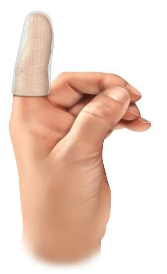
Figure 2. Drawing of the Digital Brush (Enacare, Micerium S.p.A., Genoa, Italy), a disposable gauze product containing 0.12% chlorhexidine. This device can be utilized as an alternative tool when conventional oral hygiene is unfeasible or as an additional method to improve the efficacy of self-performed mechanical biofilm removal.

disabled population, as reported in a meta-analysis (van der Weijden GA, Hioe, 2005). Consistently, no more than 60% of the overall plaque is removed during each episode of cleaning (Claydon, 2008). Less plaque was removed from mandibular teeth and lingual tooth surfaces than on the maxillary teeth and buccal surfaces (Claydon, 2008; Yuen et al., 2009).