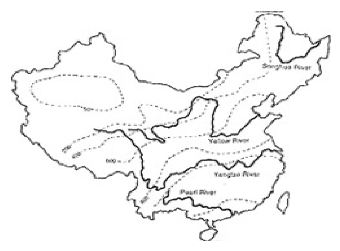
Figure 1. Distribution of swine farms and the factors affecting their development in Mainland China. a) The geographic population distribution in Mainland China. Each dot represents 5,000 persons; b) the geographic distribution of swine farms in Mainland China; and c) main rivers in Mainland China.

size pig farms from the year 2002 to 2003, especially in farms with pigs from 100 to 499 and 500 to 2,999 (17 and 23.1%, respectively; Table 1). In total, from 2002 to 2006, the numbers of medium size swine farms were increased to approximately 204%. Taking advantage of increased demand for pork and pork products in local markets, many rural households have shifted their focus from crop production to hogs and thus increased their swine herds. The aim of farming has also been shifted from "fertilizer for crop cultivation" to capital gain, with the emphasis on increasing grain feed, improving feed efficiency and reducing time to reach slaughter weight. To increase pork production, the farmers' focus is placed upon improving pig welfare by reducing and controlling managementassociated stressors, such as housing environments, stock densities, climate conditions and disease incidence. Farmers, and specially trained stock-keepers, play major roles in maintaining the pigs' health and welfare base on their experiences, economical status, religion, and education.