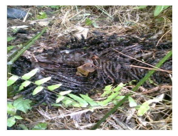
Plate 7. Empty raphia palm fruit bunches.