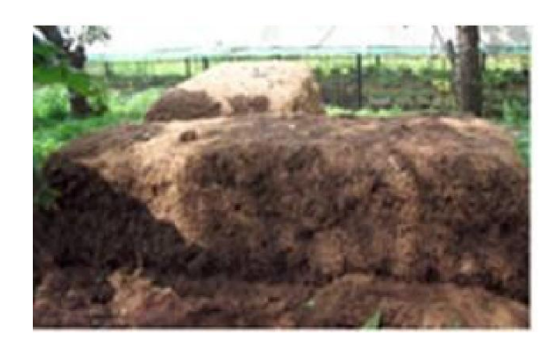
Plate 14. Coir pith heap.