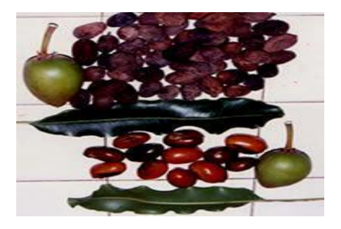
Plate 10. Shea fruits, seeds, nuts and leaves.