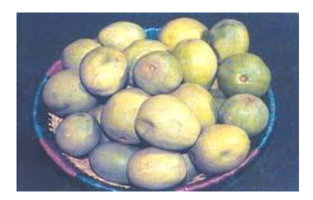
Plate 11. Shea fruits.

husks have a capacity to remove considerable amounts of heavy metal ions from aqueous solutions for example with waste water. These were found to be more effective than the melon seed husks for absorption of lead, Pb (11) ions (Eromosele and Otitolaye, 1994). There is need to conduct further research on the potentials of Shea husk.