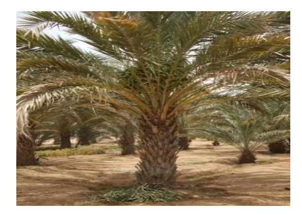
Plate 6. Date palm Tree in the field, NIFOR Sub-Station, Dutse.