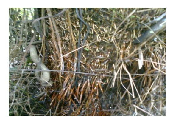
Plate 8. Raphia roots.

beneficial to human. More and more research efforts are being put forward to prove that it has many medicinal values such as an important dietary supplement to boost up immune system, assists constipation or digestive problems, assists weight control, anti-cancer agents, anti- aging properties and many more; (20) dye- the roots of the coconut plant are used as a dye.