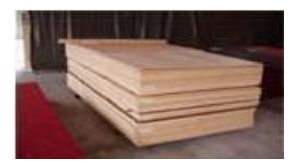
Plate 3. Plywood from oil palm trunk.

mill effluent (POME), mesocarp fiber and palm kernel shell/ cake residue (Yusoff, 2006).