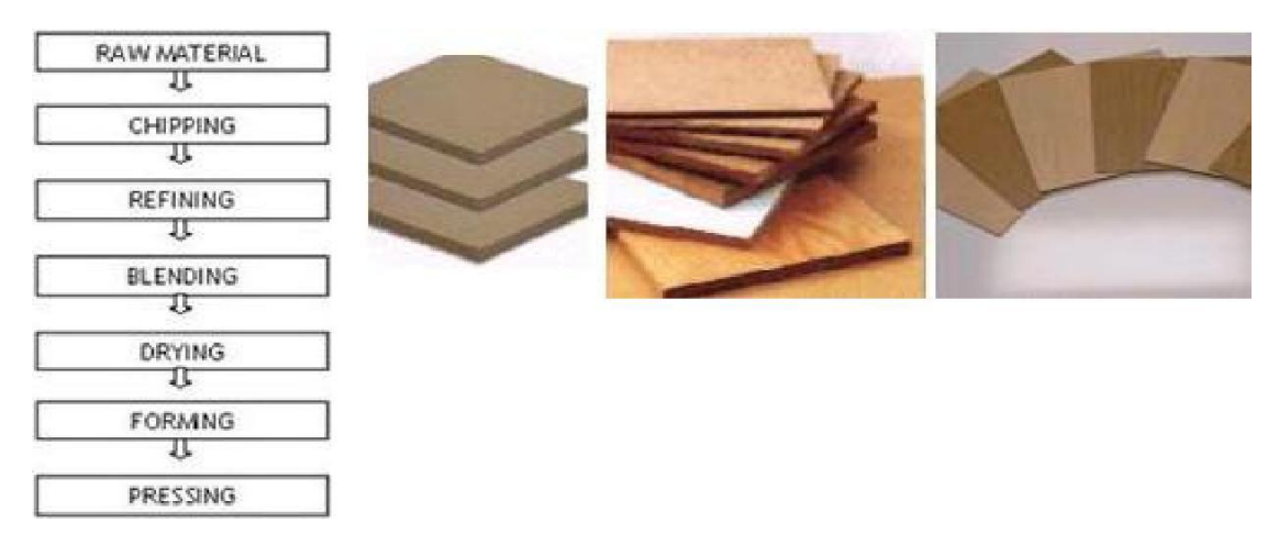
Figure 1. Flow chart of the MDF manufacturing and samples of MDF.