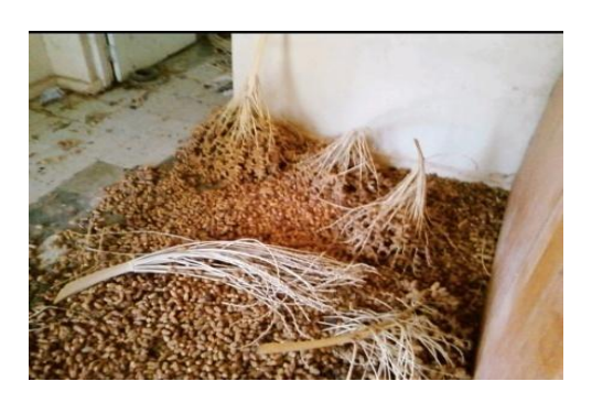
Plate 16. Flowers.