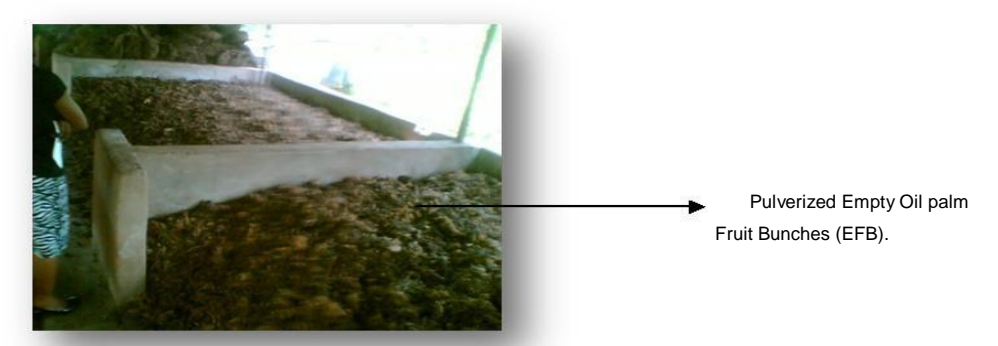
Plate 13. Typical cells used in composting, NIFOR main station, Benin City, Edo State.