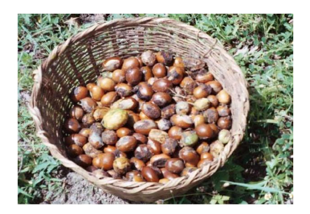
Plate12. Shea nuts.

husks have a capacity to remove considerable amounts of heavy metal ions from aqueous solutions for example with waste water. These were found to be more effective than the melon seed husks for absorption of lead, Pb (11) ions (Eromosele and Otitolaye, 1994). There is need to conduct further research on the potentials of Shea husk.