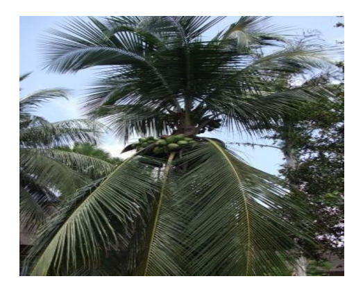
Plate 5. A coconut palm, Nigerian Institute for Oil Palm Research (NIFOR), Nigeria.

The research and development for the preparation of advanced carbon products from oil palm empty fruit bunch (EFB) had been embarked since 2003, and with recent technology, MPOB successfully developed a process on preparation of carbon pre-cursors for the production of carbon electrode, electrical carbon brushes and Molecular Sieve Carbon (MSC) for gas filtration from EFB. Chemical treatment, carbonization and physical activation processes were applied to the carbon precursors for the preparation of high porosity activated carbon powder and carbon pellets.