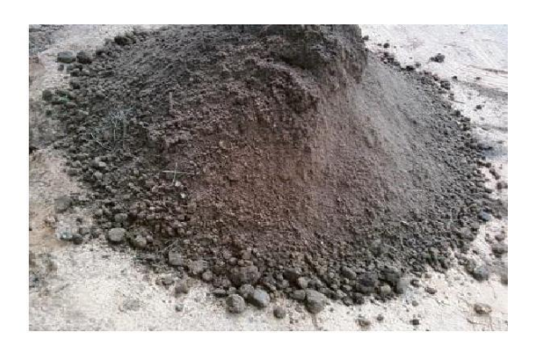
Plate 17. Cow dung.