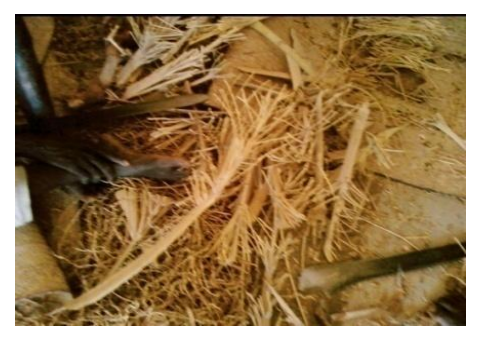
Plate 15. Sticks of bunches.