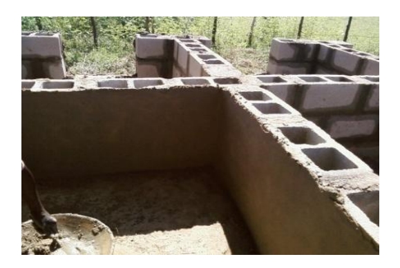
Plate 18. Compost cells under construction.

an elevated place for composting. In between coconut trees, shade under any tree is good for composting. The shady area conserves the moisture in the composting material. The floor of the compost making area should be leveled. If earthen floor is available the floor can be