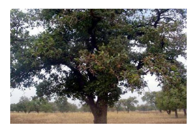
Plate 9. A typical Shea tree.